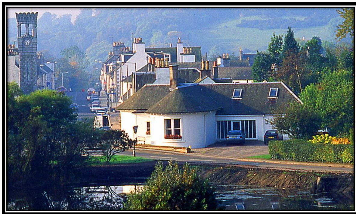
This photo was probably taken in the 1990s just after the mill pond had been dredged.

Before “The Cut” was opened in 1823, the road, or turnpike, into Gatehouse from the East came down Ann Street, past the “Old Gatehouse”, continuing along Old Ford Road, until it met a ford across the river. Prior to 1823 there was no road between the clock tower and the mill dam(s). Much, if not all, of this land was part of the Murray Arms grounds.