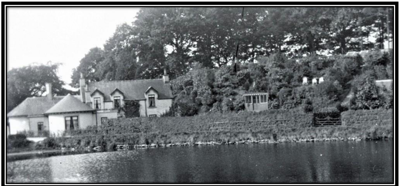
A later view from "across the pond" showing a more mature garden, including bee-hives.