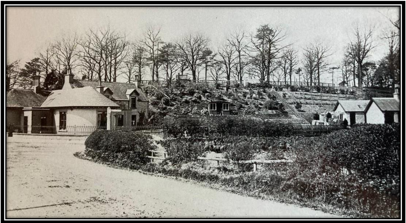
We don't have a date for this photo, but it was taken before the war memorial was erected in 1921.