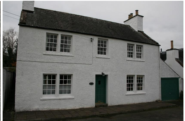
The upper photos are (1) no.3 Hannay Street & (2) no.6 Hannay Street (Clermiston Cottage). Below are no.8 Hannay Street (Victoria Cottage) and then the more modern Waterside.