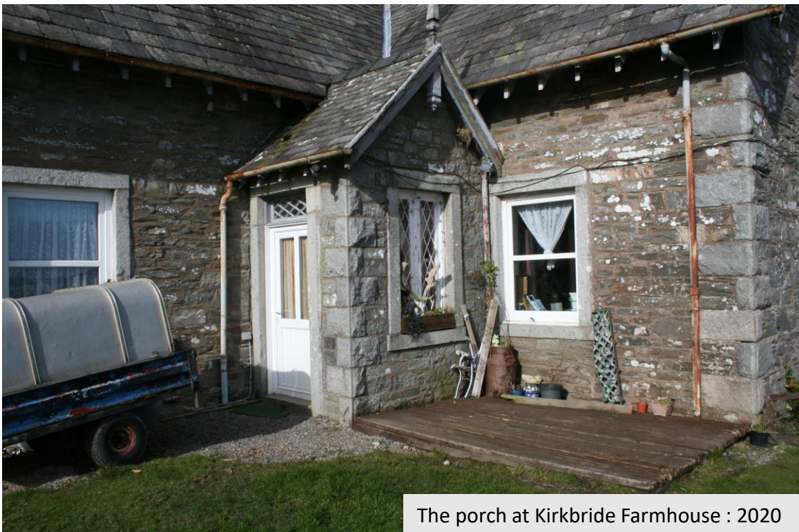
The porch at Kirkbride Farmhouse : 2020

Not recognising the photo, but knowing that Kirkbride was built on similar lines to Dalmalin Lodge, Isabel McLeod suggested that we try Kirkbride farmhouse.