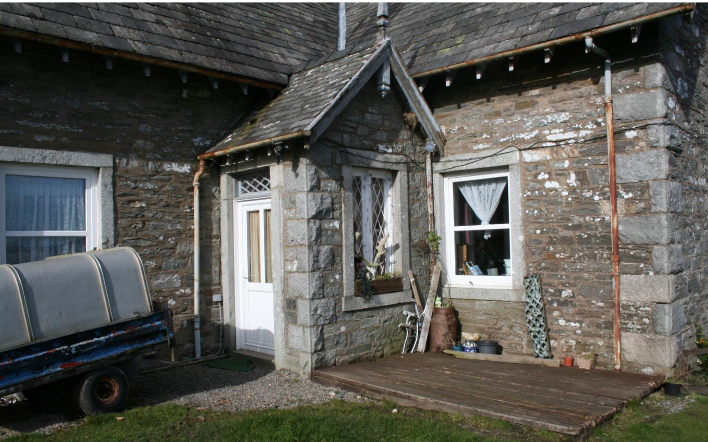
The porch at Kirkbride Farmhouse : 2020