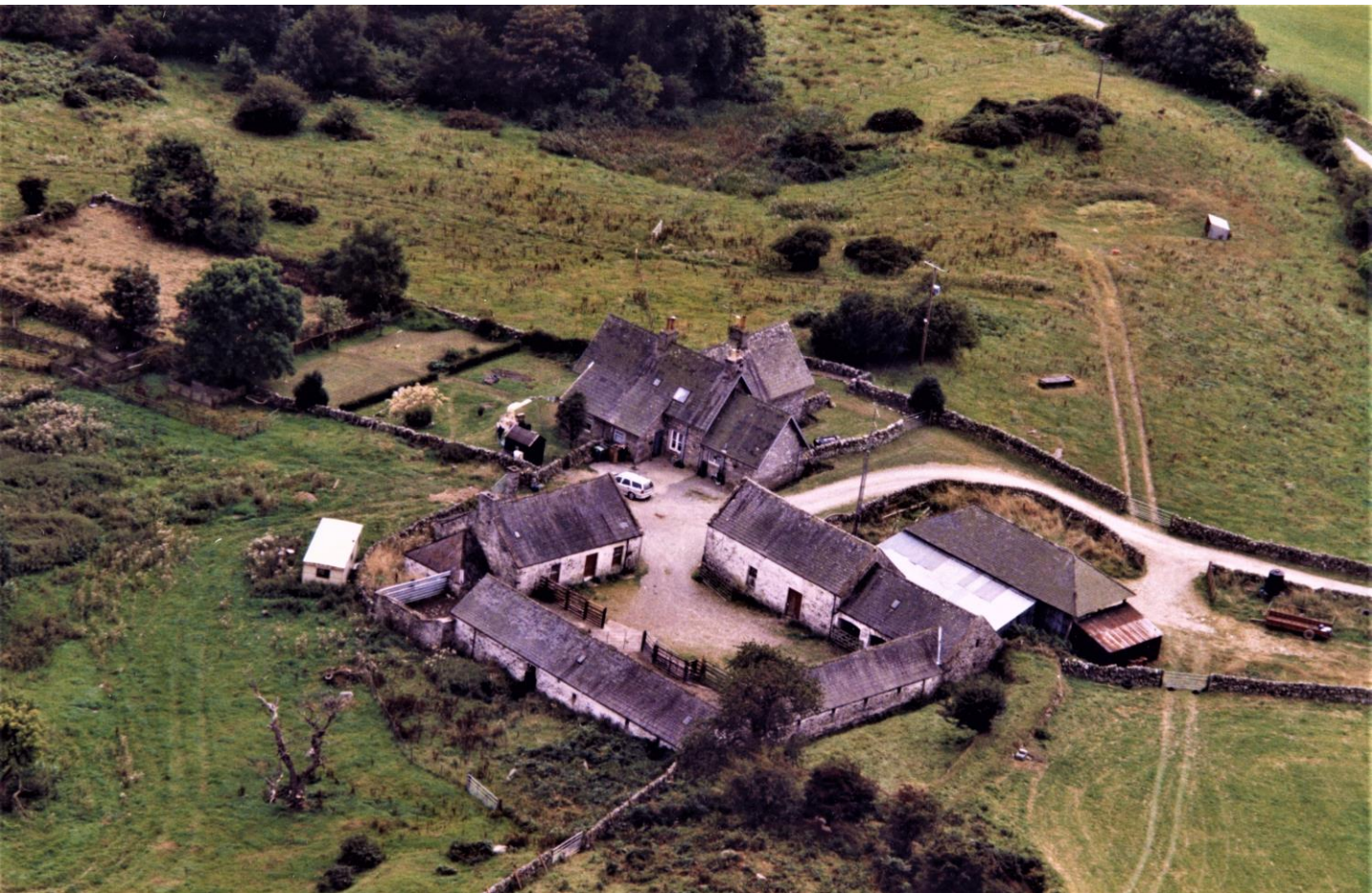
This aerial view of Kirkbride was taken in 2003