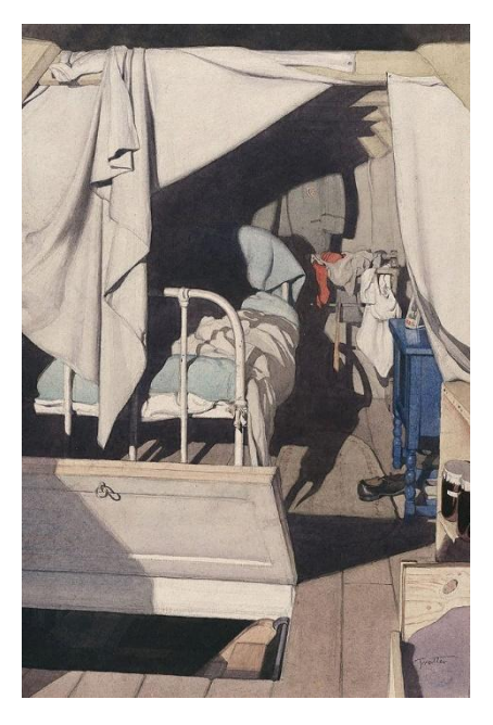
Bed in the Attic