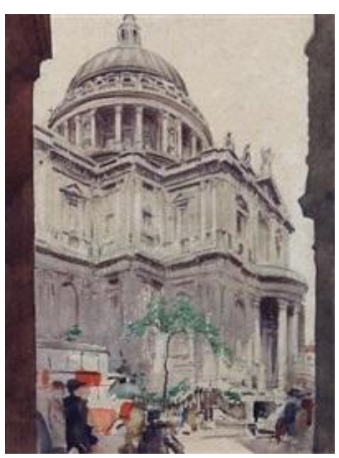
St. Paul's Cathedral Has been for sale on a number of websites