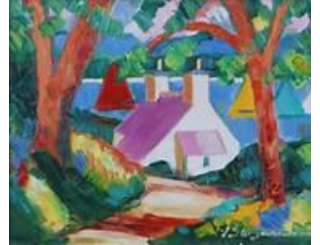
Cottage by the Sea