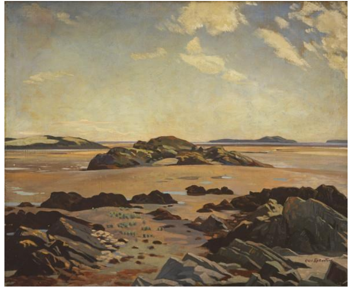
Fleet Bay, Kirkcudbrightshire ex National Galleries Scotland