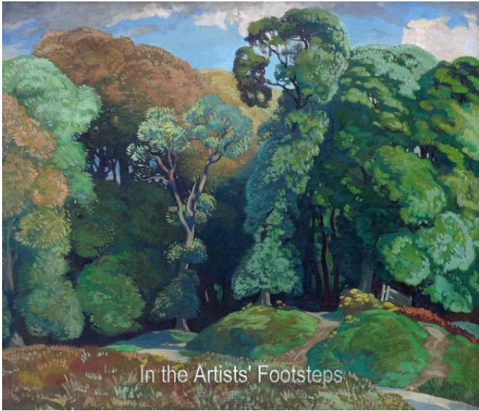
Boreland Wood, Gatehouse