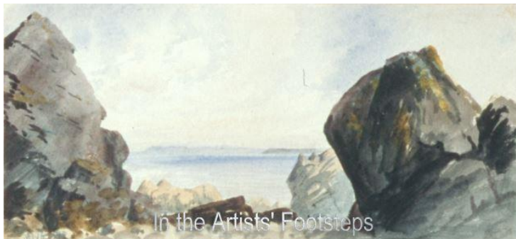
Kirkdale Rocks with Isle of Man in Distance