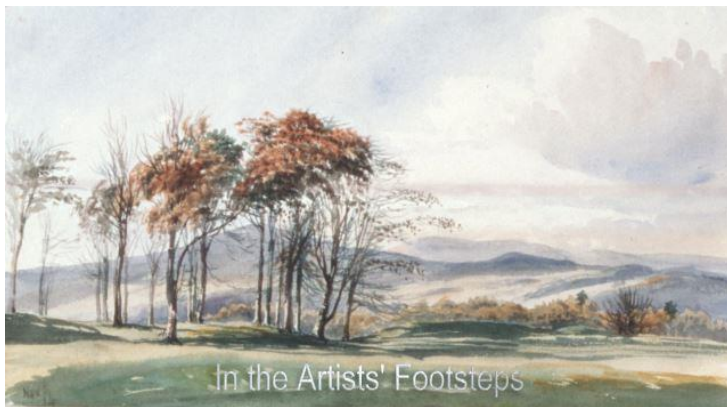
Cairnsmore from Kennel Field