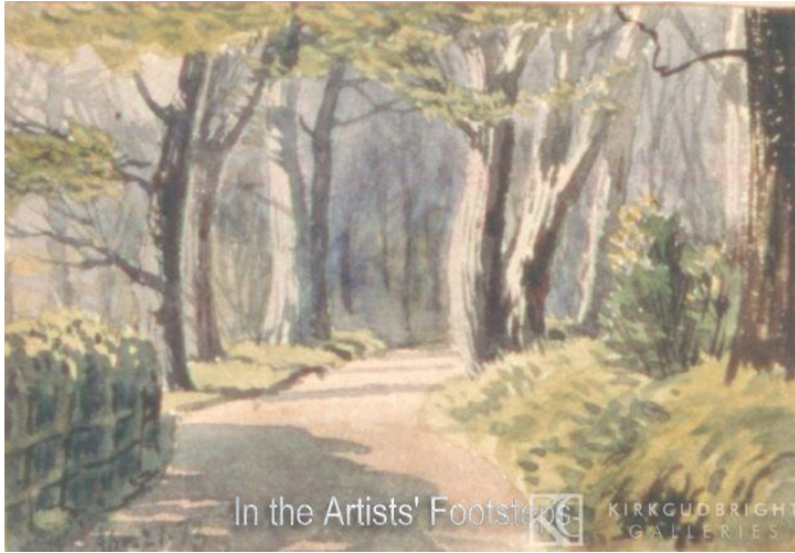
Lady Anne's Walk