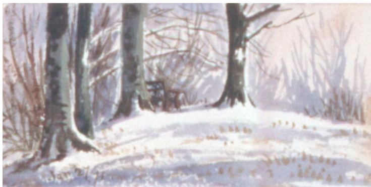
In Parsonage Wood