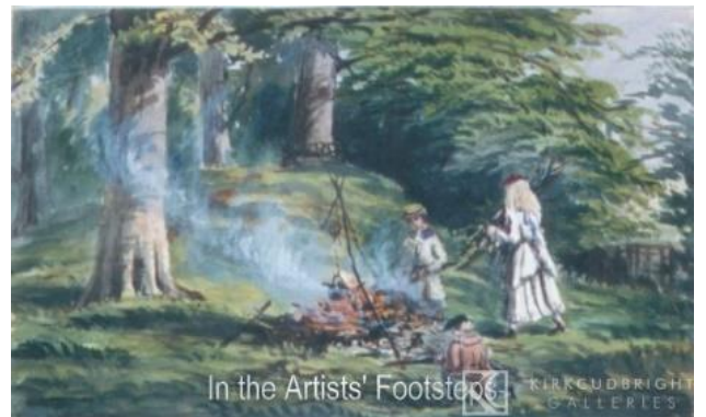
In Parsonage Grove