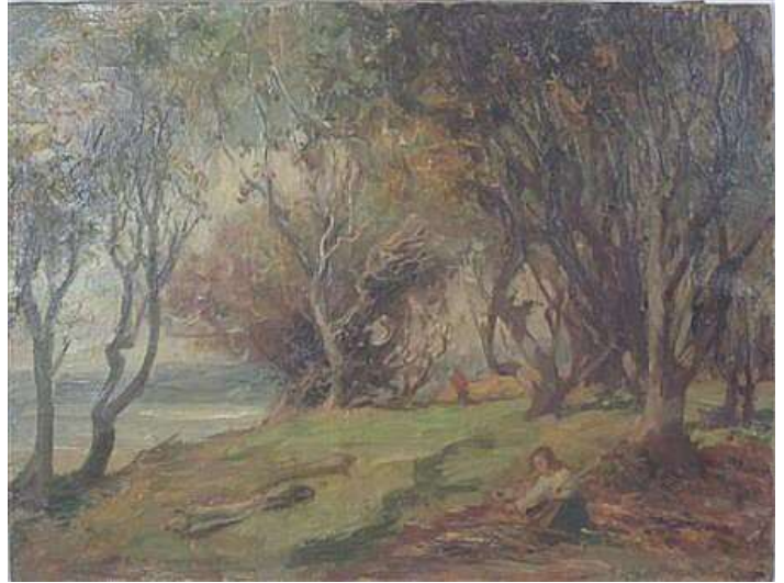
Woodland on the Solway