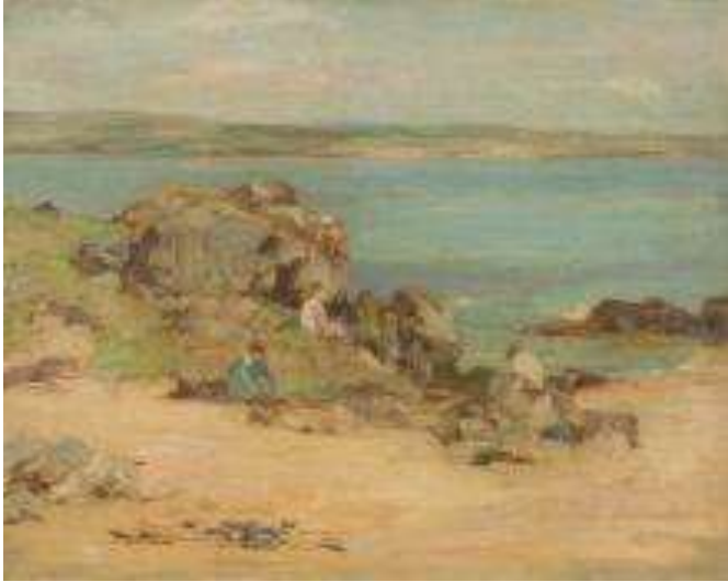
On the Solway