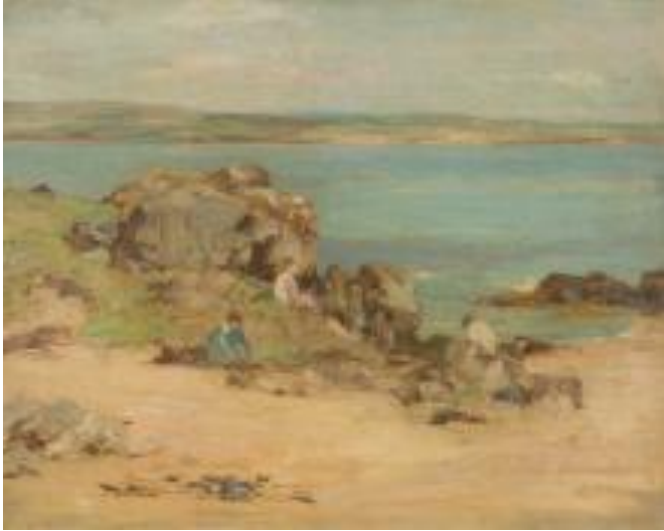
On the Solway