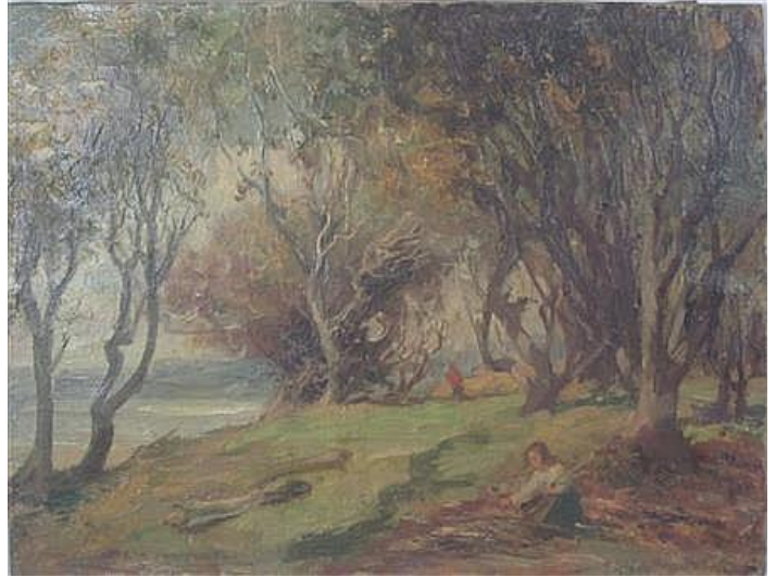
Woodland on the Solway