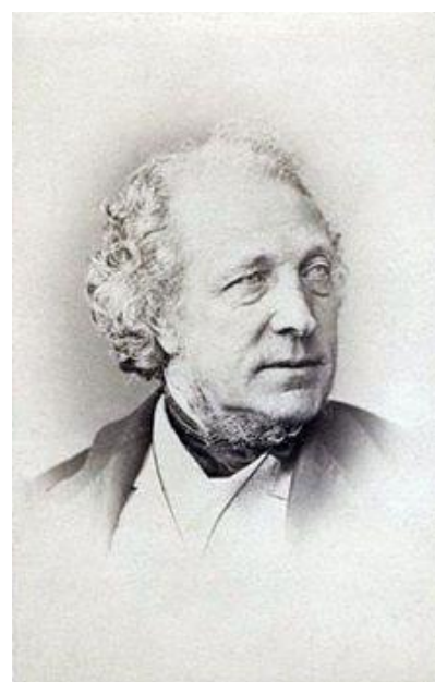
Drawing of William Leighton Leitch