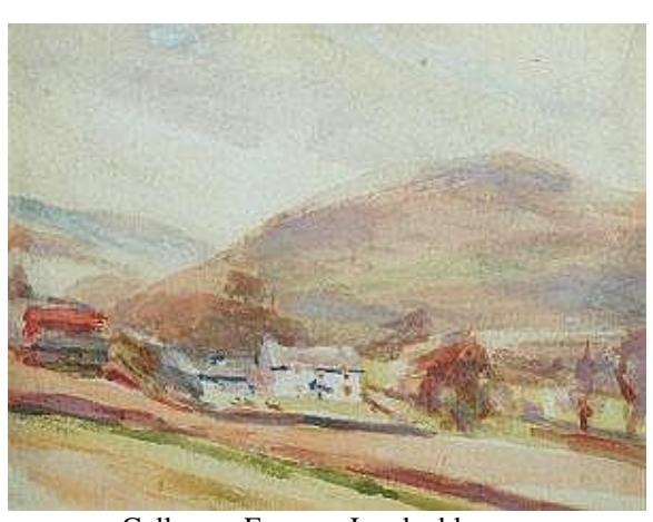
Galloway Farm ex Invaluable.com