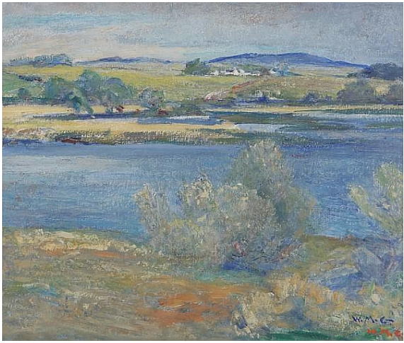
Loch Ken ex Duncan Miller Fine Arts