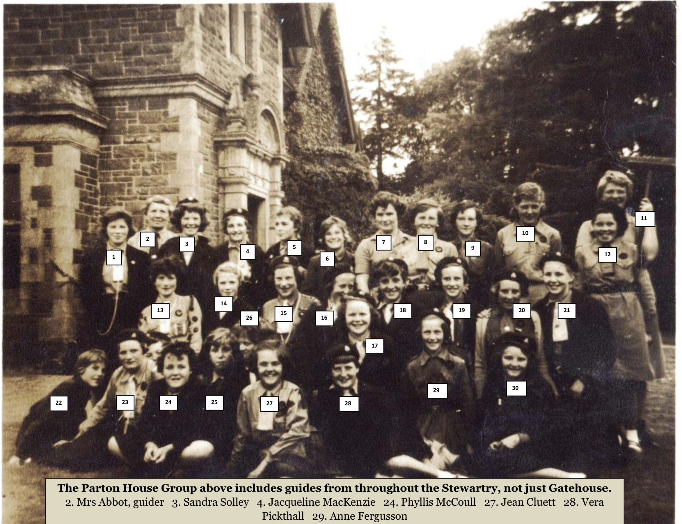
The Parton House Group above includes guides from throughout the Stewartry, not just Gatehouse.