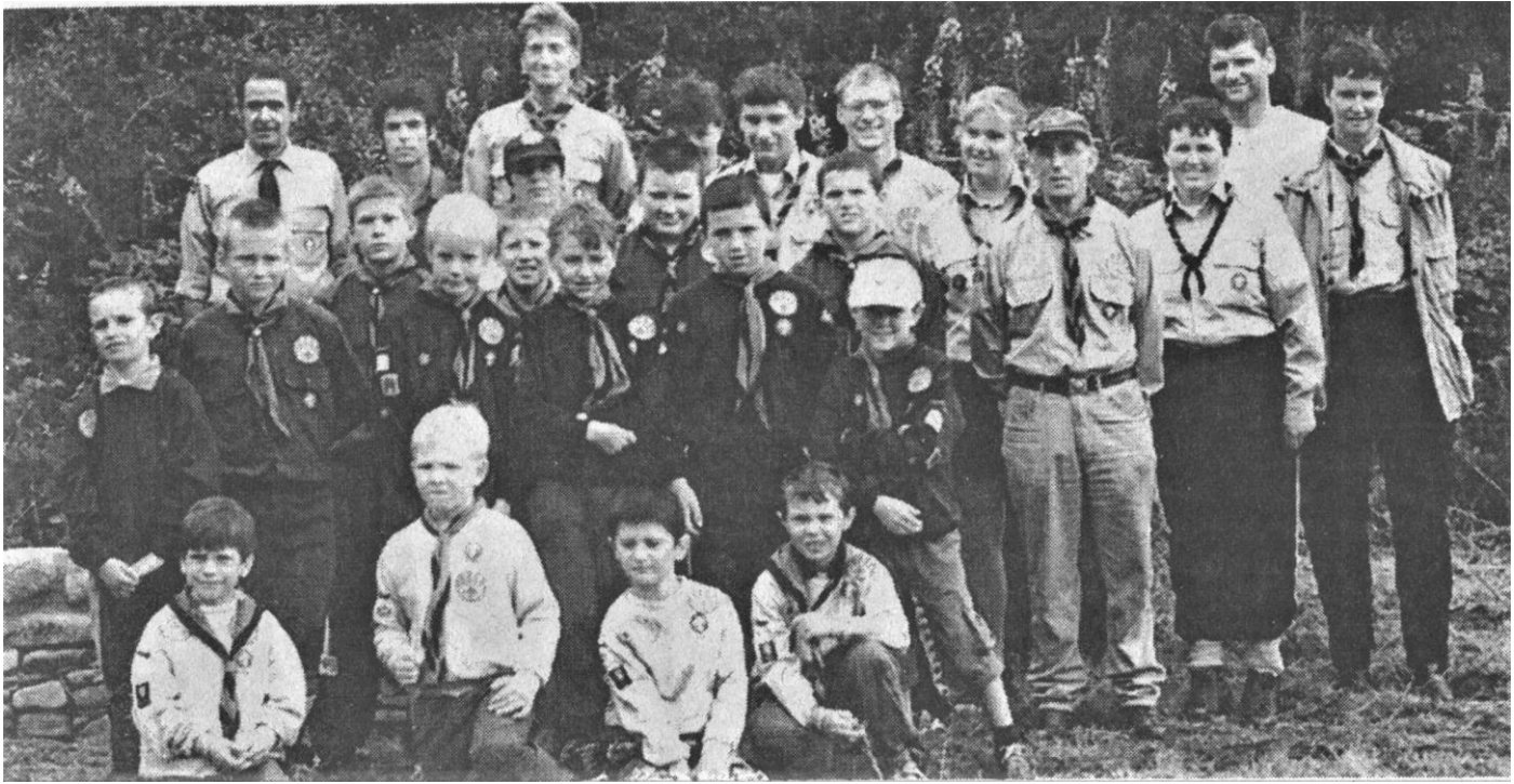
Members of the Gatehouse Scout Group who enjoyed the 5-day camp at Kirkdale Port