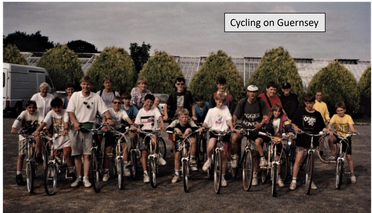
Cycling on Guernsey