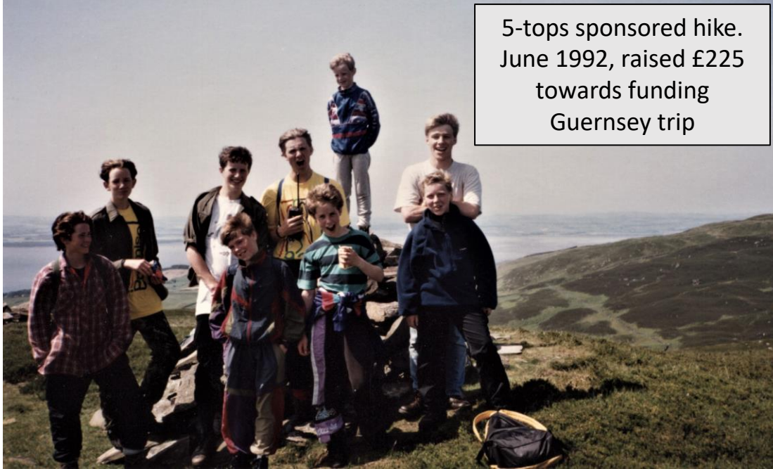
5-tops sponsored hike. June 1992, raised £225 towards funding Guernsey trip