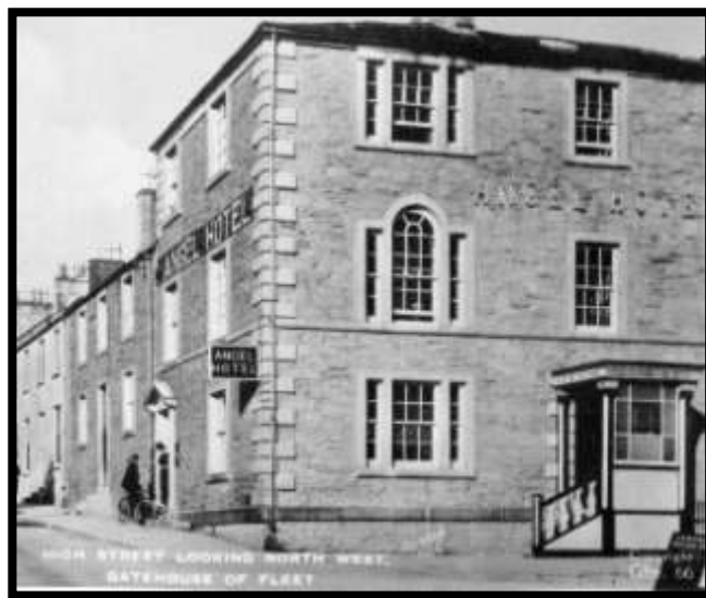
No.70 High Street