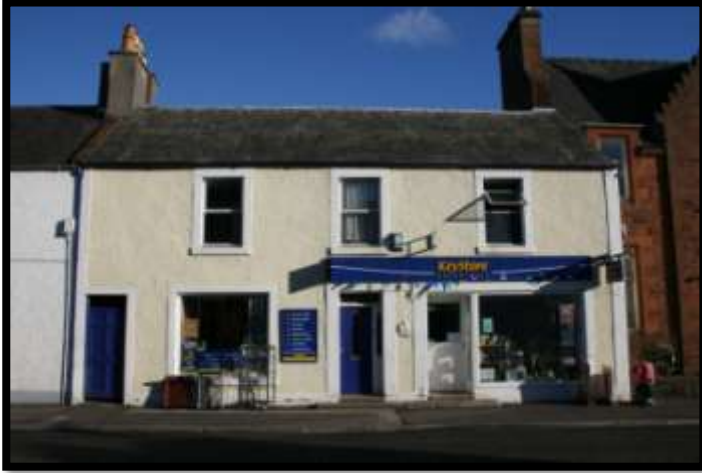
Keystore is now "Gatehouse Store".