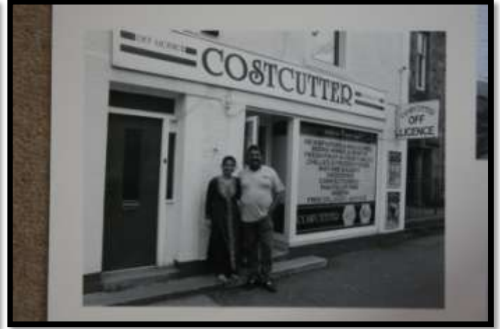
Previously it was Costcutter.