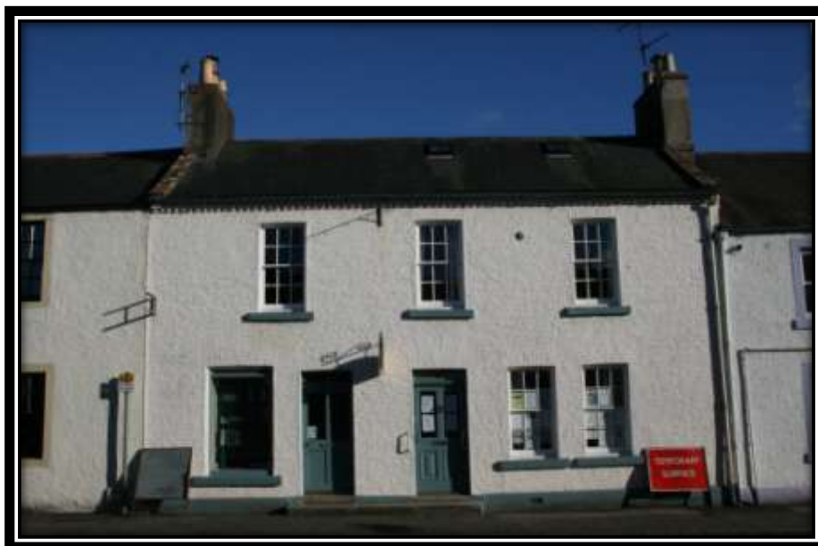
No.42 was the bakers shop. No.44 is on the right.