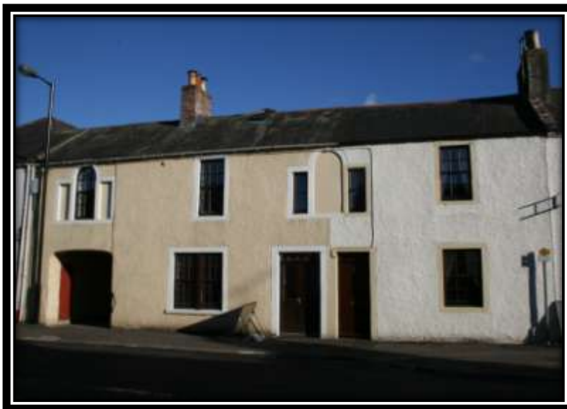
38 High Street (cream coloured wall) + 40 High Street

This is known locally as the “Well Entry”, because the opening to the left of no.38 leads through to Garries Park and to the old town well.