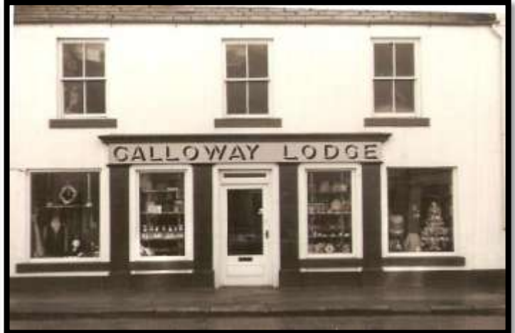
Galloway Lodge c.2000