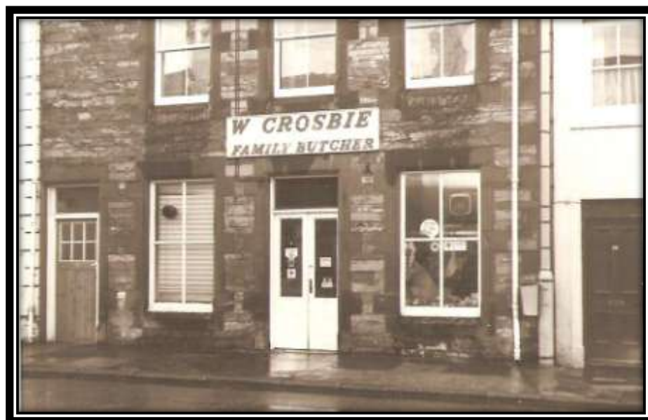
No.12 is a house entrance, 14 is the butchers shop (probably taken in 1976)