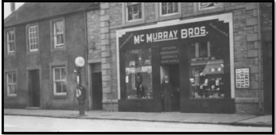
McMurray Bros. at 8-10 High Street before and after the integrated shop front was added.