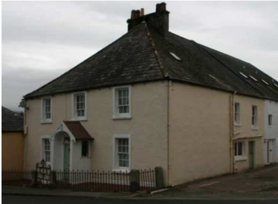
71 High Street, Bruachmore

Bruachmore & Brae Cottage are part of the old “Brewery Buildings”, which also included the brewery itself which has been converted into flats. Parts of the “Devil’s Elbow” property was probably also included. We are not entirely sure that we have separated the owners and occupants of each part of the brewery buildings correctly.