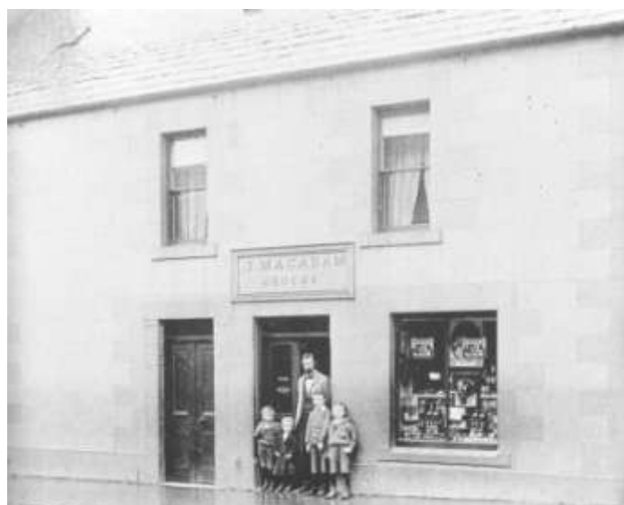
Door to 51 + Shop @ 49 High St. (c.1905 ?)

For many years no.49 was Macadam's grocer's shop. It is now a charity shop.