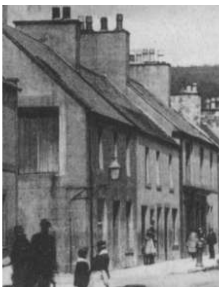
37 to 27 High Street

The occupants of this building have been particularly difficult to identify with certainty.