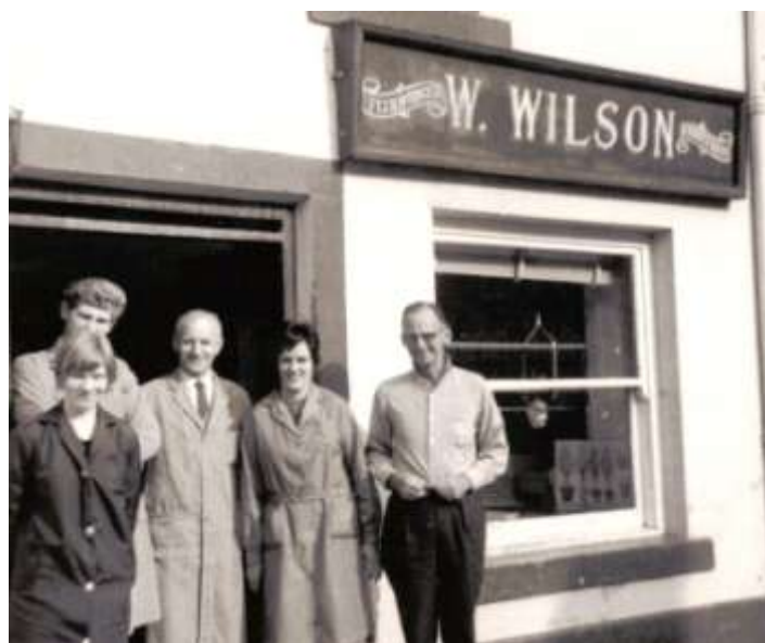
Wilson Fishmonger's at 31 High Street