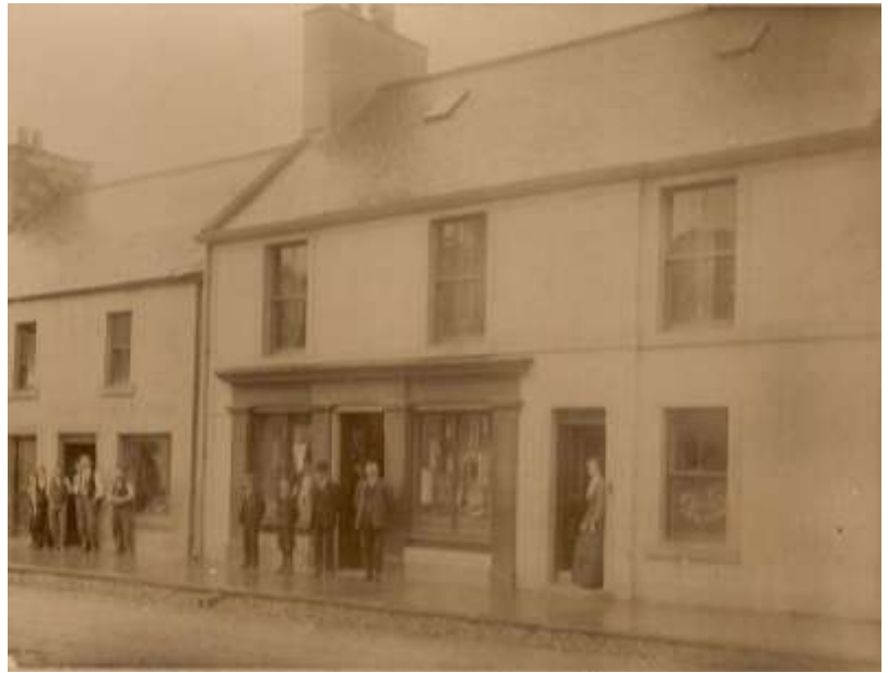
The big shop front is no.29 and the shop name above is "Jardine & Palmer". The lady in the doorway to no.27 is at the entrance to "Milliner's Showroom", which is inscribed on the window to the right.