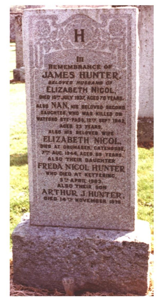
Anwoth churchyard, Gatehouse-of-Fleet