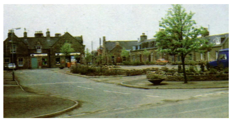
The Square, Tarves