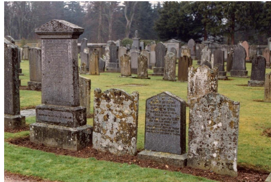
Nicol gravestones at Monymusk