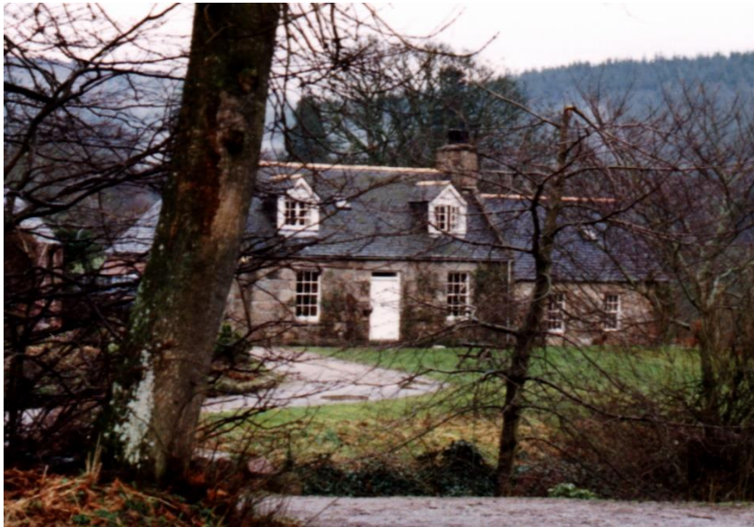
Ord Mill, near Monymusk