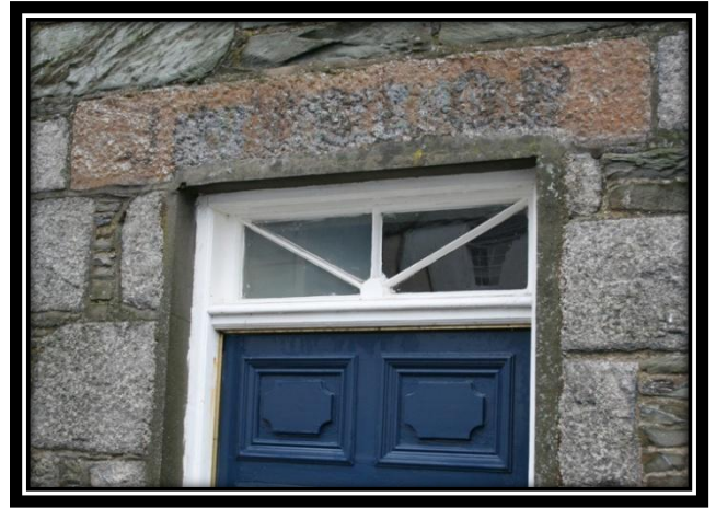
Lintel of no.24, showing inscription "J HYSLOP".