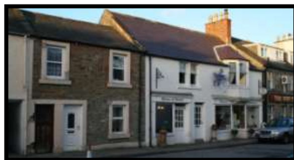
House of Malts is no.9, Fleet Gallery is no.7

These days nos.7 & 9 Fleet Street is a property under single ownership and occupancy with 2 shop fronts, but for a long time there were a number of separate small apartments with in excess of 20 people living in the property. The small apartments meant that annual rent was low and the occupants did not need to be identified in the valuation rolls.