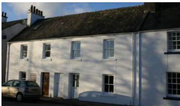
41 & 39 Fleet Street