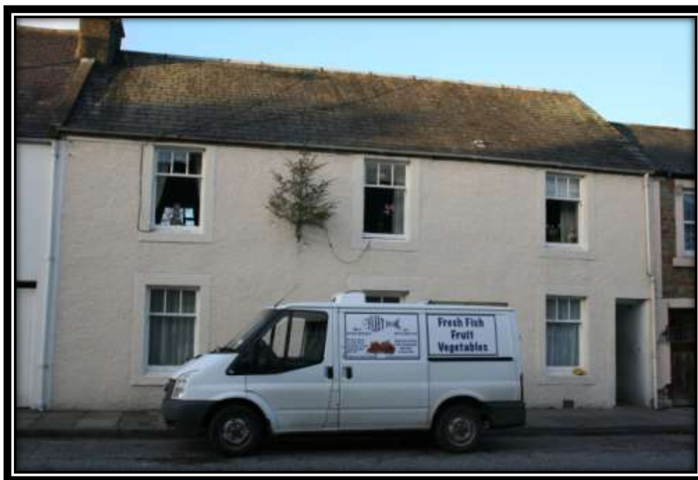
15 & 13 Fleet Street

This building occupies a double plot, and the numbers allocated to it are 13 and 15. At some time, probably in the 1950s the property was divided into two halves, an upper and a lower flat, each occupying the full width of the double plot. Since then the lower floor has been referred to as 15A and the upper floor as 15B. No.13 does not exist.