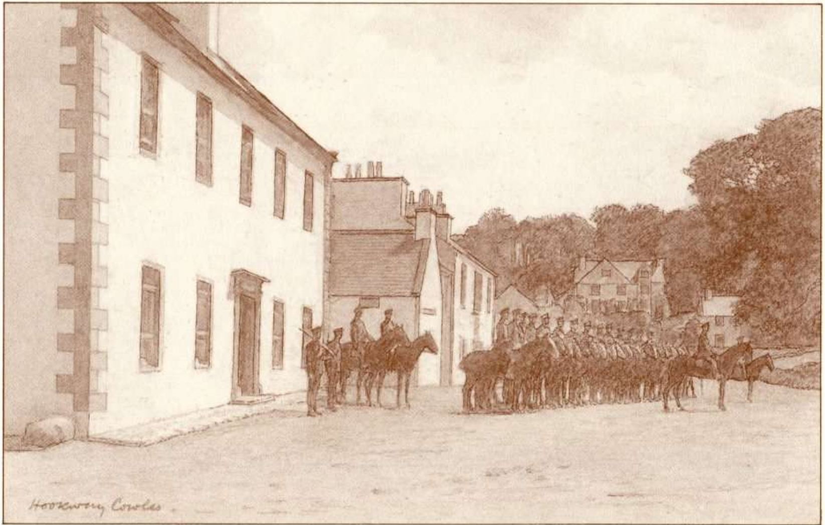
Ayrshire Yeomanry, 1914-18