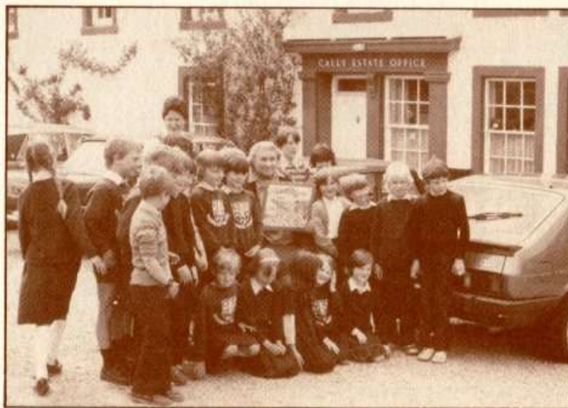
Venniehill . Jubilee